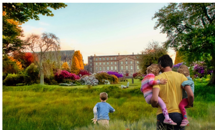
Ushaw Chapels, WCPF 2023, Ushaw Gardens

23 March – 23 June 2024 Woodland Rd, Durham DH7 9RH