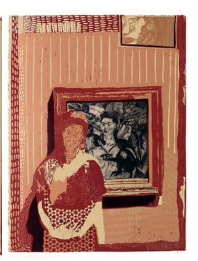
Four Men in a Museum (2021), Private View (2020), Woman Dressed as Frido in front of Frida Kahlo Self-Portrait (2020)